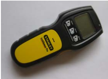
Figure 3. Wall Stud Detector

A similar approach is to use some form of external 'tool' for meta-level modifications. This happens in the real world; Figure 3 shows a stud detector, which detects the wooden studs in a wall so that you can screw into them. The wooden structure is hidden behind plasterboard and wallpaper, but the stud detector reveals it – the "provide visibility" appropriation principle [9] in the physical world.