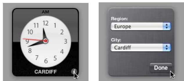
Figure 2. Mac OS Dashboard widget (a) front – UI (b) back – metaUI

Today in the Apple Dashboard just such a mechanism is found on widgets. Instead of a screw a little 'i' for information icon, clicking it 'turns around' the widget showing settings behind. Strangely the iPhone reverted to a special place for settings rather than associating them closely with their application.