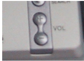
FIGURE 4: Volume control – linked buttons.

cup across the table you can also push it back in the opposite direction; unless it falls off the edge, opposite pressures have opposite effects.