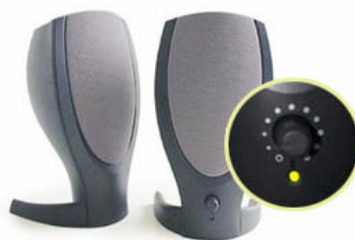
FIGURE 2: Speaker control

Sometimes hidden state is the result of aesthetic rather than usability decisions, but also hidden state controls can be useful where the logical system has large numbers of states, or where the calibration between device state and logical state needs to be dynamic. For example, if the dial could turn completely round several times to increase or reduce volume there would be no one-to-one relationship between location and volume. Also if the same control is used to manipulate different aspects of the logical state in different modes or there are large numbers of internal states, then it may be impossible to have a simple mapping.