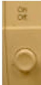
FIGURE 3: On/Off control with bounce back – is it on or off now?

Some control devices return to their initial position soon after we release our fingers or hands from the knobs/buttons. For example, the on/off power button on many PCs. When we push the button in, the effect of this action starts up the system and the button returns to its initial position. This particular effect is what we call ‘bounce back’. Other examples that exploit bounce back include joysticks, mouse buttons, a mobile phone’s volume controller and MiniDisc controls.