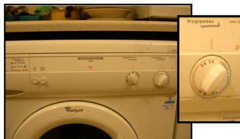
FIGURE 5: Washing machine and its control.

Note how the kettle’s on/off switch differs from a simple on/off switch such as a light switch. In the latter there is no control involved from the system, it solely depends on the user’s interaction.